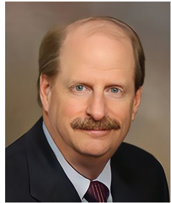
Jeff Hannon Family Law