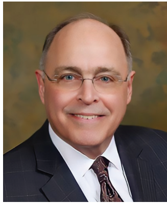
Patrick Dragga Family Law